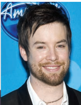
David Cook, Recording Star, American Idol Season 7 Winner